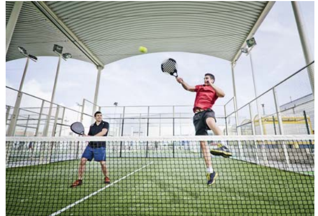
Durability to withstand impact

Bear River Zeolite BRZ™ is a naturally occurring volcanic rock that contains clinoptilolite.